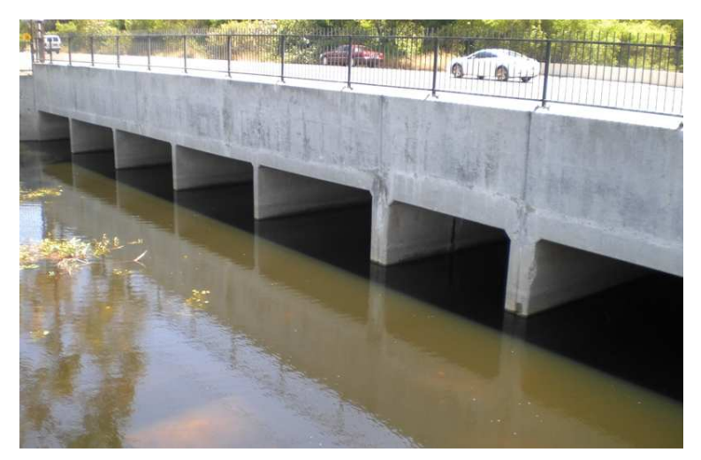
Figure 3: Wilmington Drain at Pacific Coast Hwy

Table 1 lists the monitoring site, type, nearest intersection and rationale for site selection.