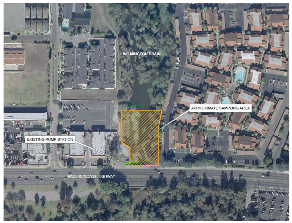
Figure 4: Aerial View of the Wilmington Drain Bed Sediment Sampling Location

Based on the proposed contours in the current Wilmington Drain Multi-Use Project construction plans, the LACFCD's approximate sampling area is likely to be as shown in Figure 4 . This location is the lowest accessible-by-foot area that is likely to be dry within a reasonable timeframe after the storm season, but outside of bird nesting season. The location is subject to adjustment based off of final contouring as shown in the project as-built drawings.