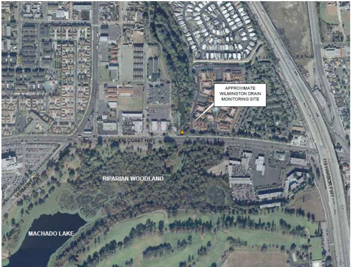
Figure 2: Aerial View of Wilmington Drain Monitoring Site

The southern-most portion of the Wilmington Drain is a 150-foot wide soft bottom channel located west of the 110 Harbor Freeway and east of Vermont Avenue between Lomita Boulevard and Pacific Coast Highway. Wilmington Drain directly discharges into the riparian area north of Machado Lake. Approximately 88 percent of the Machado Lake Watershed area flows through Wilmington Drain into Machado Lake. This accounts for approximately 12,097 acres from several subwatershed areas, which include discharges from all responsible jurisdictions listed in the Nutrients and Toxics TMDLs (Caltrans, General Stormwater Permit Enrollees, and MS4 Permittees). Monitoring results at the Wilmington Drain site will be representative of the cumulative contribution from all of these jurisdictions. An aerial view and photo of the Wilmington Drain monitoring site are shown in Figure 2 and Figure 3 , respectively.